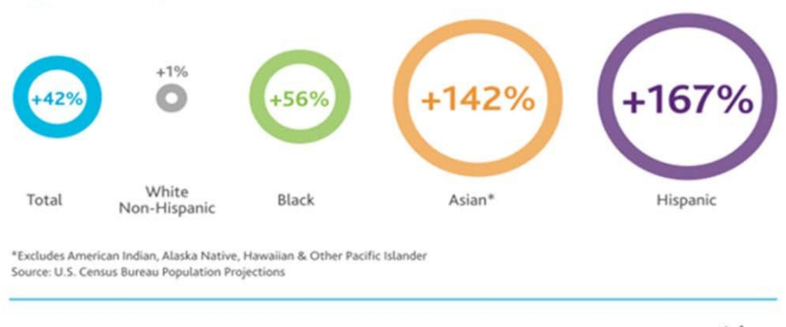
Projected U.S. Population Growth From 2010 to 2050